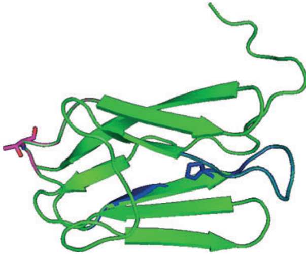
Fig. 2. Model of the structure of the 1st domain of protein MYBPC3 in wild type form (green) and of the polymorphic forms, A31P (blue) and A74T (magenta). The protein backbone is represented as ribbon, and the beta strands as flat arrows. Residues 31 and 74 of polymorphic forms are shown in stick representation. The picture was made using PyMOL Molecular Graphics System.

overall fold and stability of the protein and so the mutation can cause HCM. To the contrary, A74T, also located externally, seems not to alter any structural feature of cMYBPC. However, it could potentially disturb the interaction that the protein might have with other proteins or interactors.